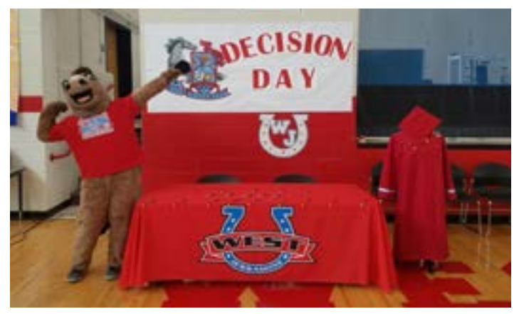
West Jessamine High School participated in College Decision Day in 2018.